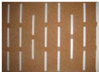
"Underlay AcoustiCORK T31"