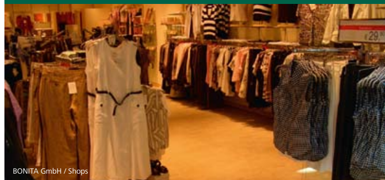
BONITA GmbH / Shops

Corkcomfort , which has a candid cork appearance in varied and innovative tones and patterns was the product chosen by a top-end German retail chain: BONITA GmbH's shops, located in various regions of Germany, now boast Corkcomfort floating floors, product reference Bonita Cream with HPS finish, with a total of 19,000 m 2 installed between 2004 and 2009.