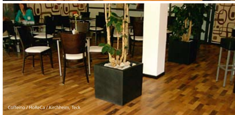
Coffeino / HoReCa / Kirchheim, Teck