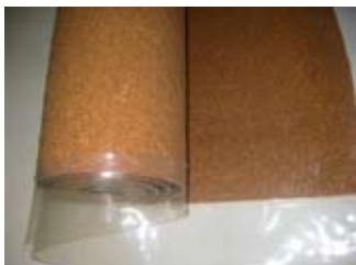
"Underlay AcoustiCORK C31 PE"

The technical specification sheets of these new AcoustiCORK underscreed and underlay products can be viewed at www.acousticork.eu .