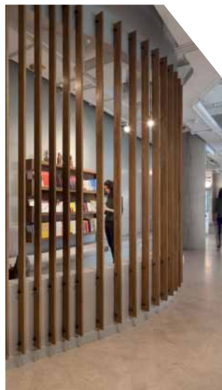
SHOPIFY HEADQUARTERS, CANADA