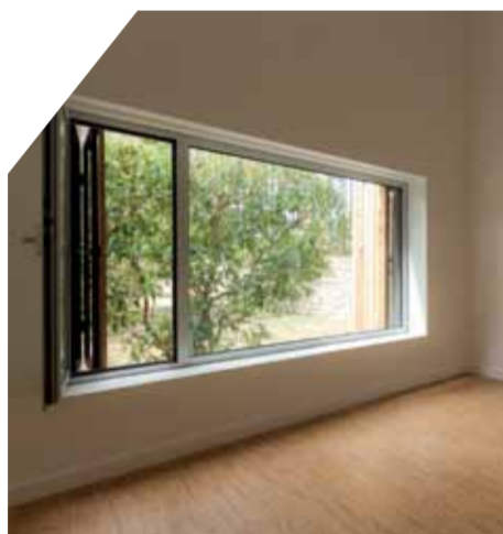
SETE CIDADES LAKE LODGE - AZORES, PORTUGAL