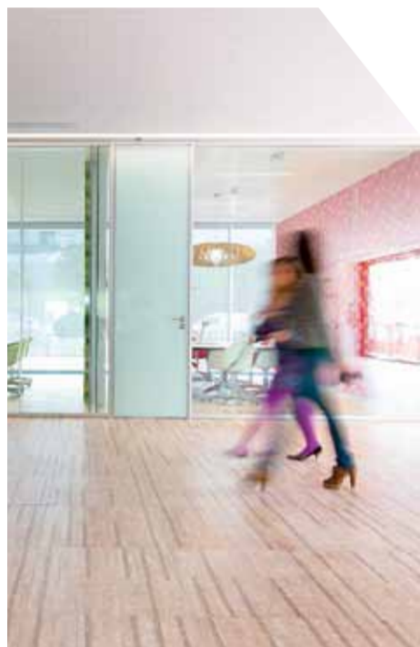
MICROSOFT OFFICES, PORTUGAL